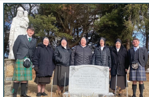
Top Photo: What a warm and lovely welcome from the Sisters